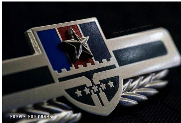
Joint Logistic Support Force Emblem